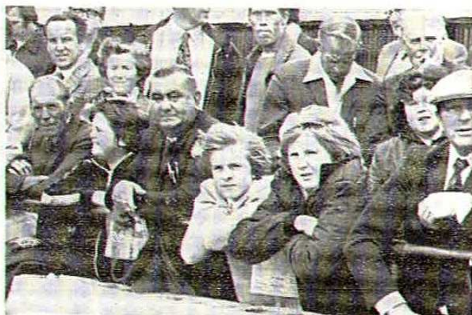
Fan of the Week: The supporter ringed above can claim two with Gillingham on Saturday if he identifies himself at the S